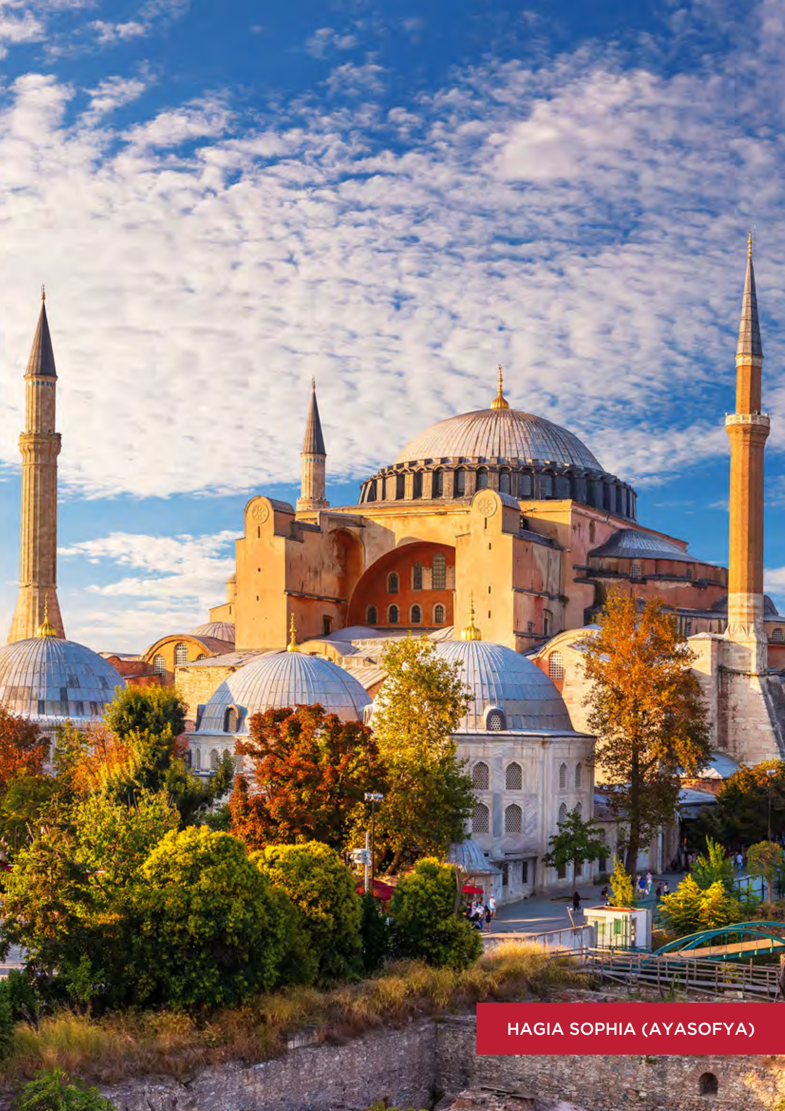
HAGIA SOPHIA (AYASOFYA)