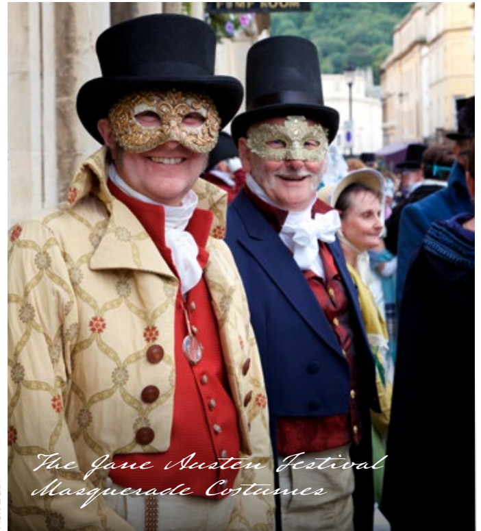
The Jane Austen Festival Masquerade Costumes

LOCATED AROUND TWELVE MILES FROM THE SOUTH-EAST OF BRISTOL AND ALMOST 100 MILES WEST OF LONDON, BATH IS ONE OF THE MOST UNIQUE CITIES IN THE UK AND HAS BEEN LISTED AS A UNESCO WORLD HERITAGE SITE SINCE 1987.