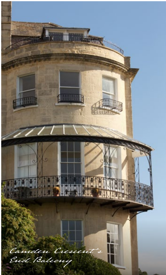
Camden Crescent's End Balcony