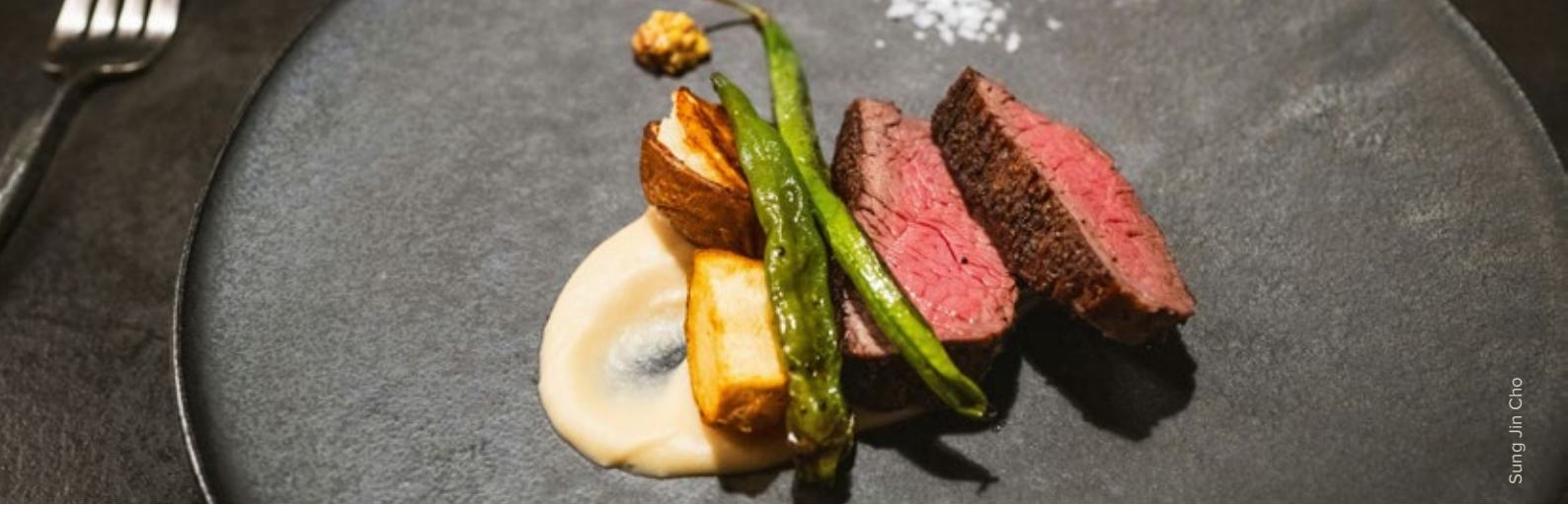
Sung Jin Cho